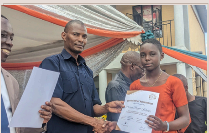
Awards / Celebration