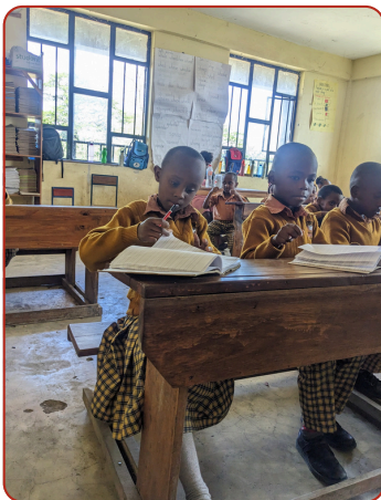
Students at Bethlehem Star School, 2024

In 2024, TUFOI successfully expanded its education sponsorship program and strengthened health and nutrition initiatives, advanced environmental conservation, and supported sports in local schools. These achievements were made possible through the invaluable contributions of volunteers from STEP AFRICA, Danish Volunteer Services, Africa Heart Desire, and members of the Tupendane Foundation.