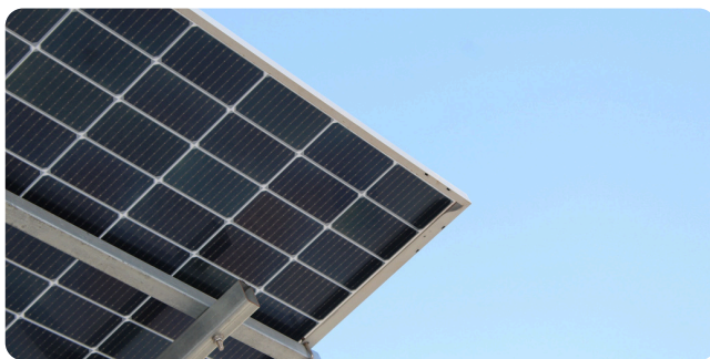
Solar Panels at School

Supported by Mati Super Brand Company (TZS 3,000,000) and other stakeholders (TZS 724,000)