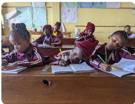
Pupils in Class

The 2024 scholarship covered school fees, uniforms, and school supplies. Volunteer teachers from STEP AFRICA assisted in the classroom, while donors sponsored individual children under a personal sponsorship model tracking each child's progress.