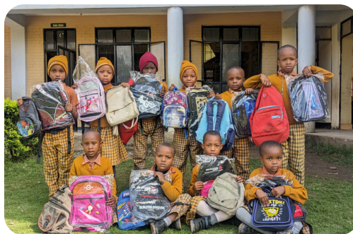
School Uniforms / Supplies