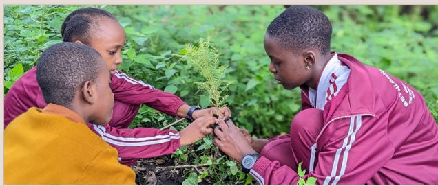
Tree Planting Activity