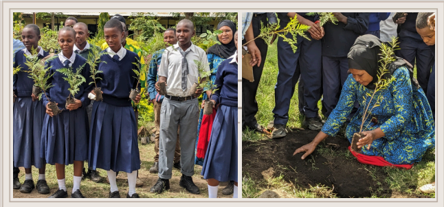
Community Tree Planting