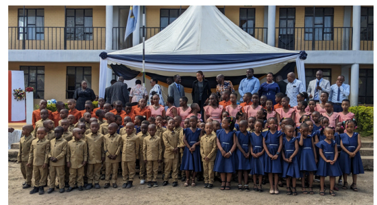
Graduation / Award Ceremony