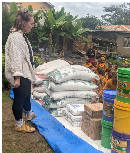
School Supplies Distribution