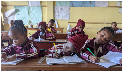
Pupils in Classroom