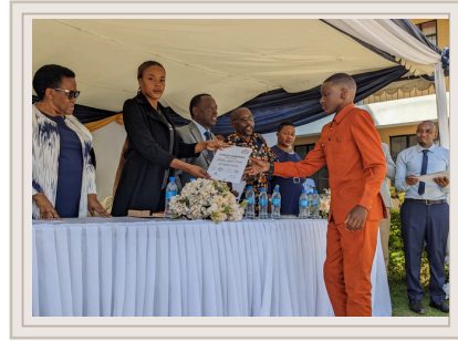
Award / Recognition