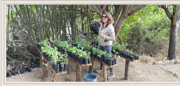
Tree Seedling Distribution