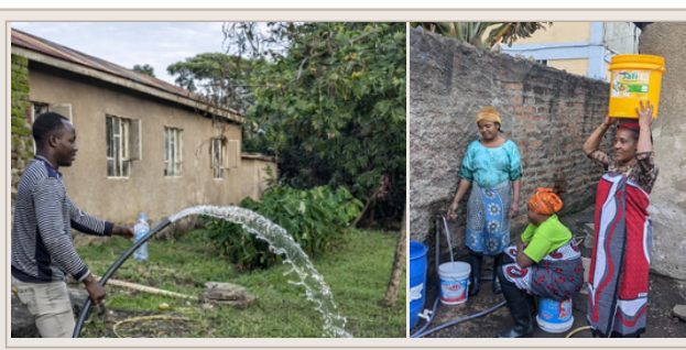
Community Using Water