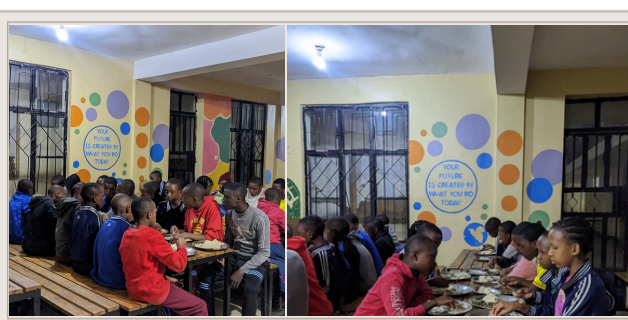
School at Night / Lit Classroom